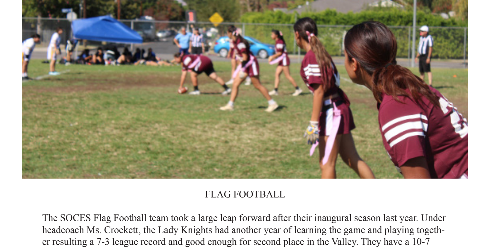
In their final game of the regular season the Lady Knights trounced Alliance Marine-Innovation & Technology 51-0. It was SOCES' third win in a row. SOCES finished the season winning six of their

experience, but the squad has a lot of great young talent looking to make an impact. The future looks bright with the JV squad going undefeated and many of them looking to play varsity.