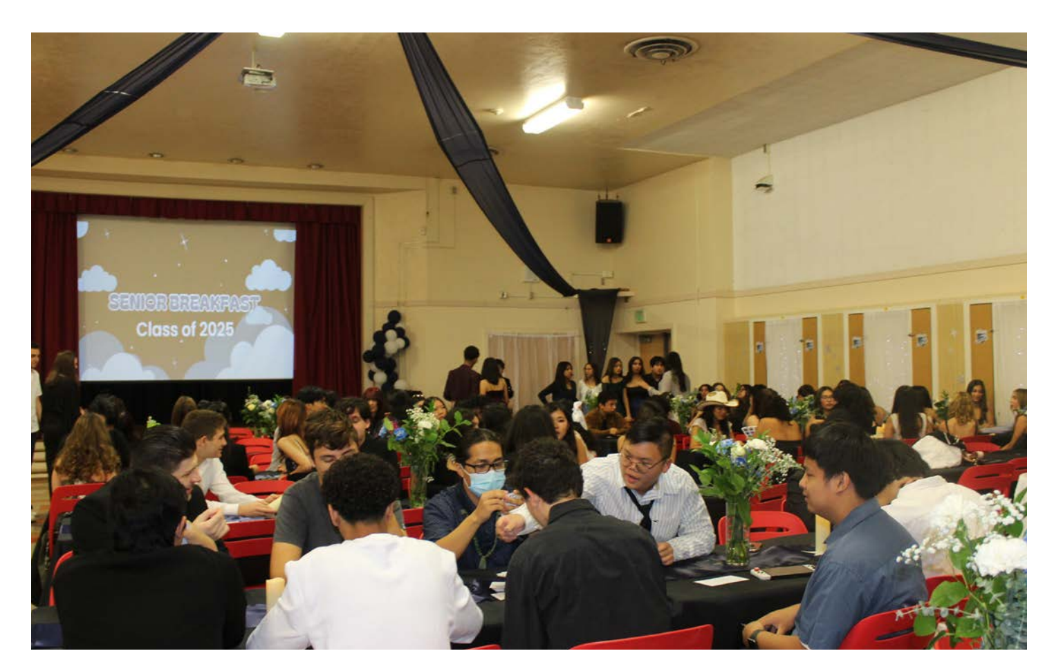
Seniors getting situated in their seats at Senior Breakfast.